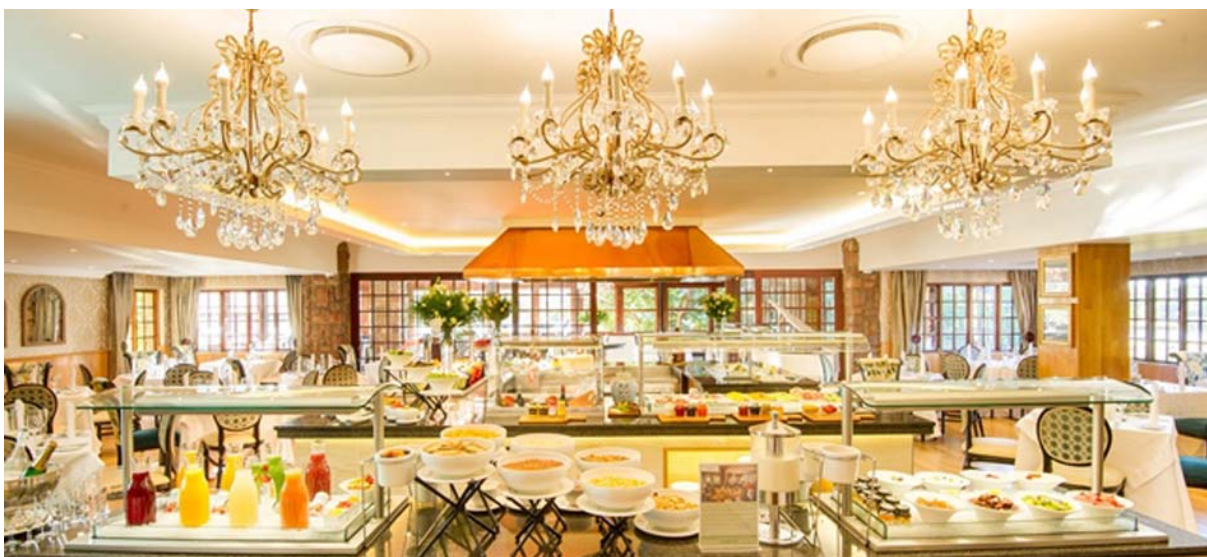
The 5-star breakfast buffet at the Irene Country Lodge

With regard to special restaurants, we visit South Africa's first indigenous South African cuisine restaurant (the Africa Café in Cape Town), one of the oldest established restaurants on Cape Town's Victoria & Alfred Waterfront (Quay Four), JJ's restaurant in Knysna (where the staff serve and sing), Harries Pancake House in Graskop (renowned throughout South Africa), and a restaurant founded by Nelson Mandela's presidential chef (Chefs@566, in Pretoria).