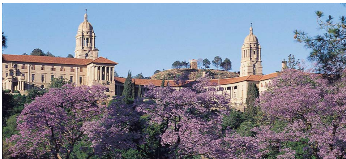
Pretoria's attractively landscaped government buildings

Not included within the price of the tour: a South African visa, the cost of a Table Mountain cable car return ticket, gratuities to local service providers.