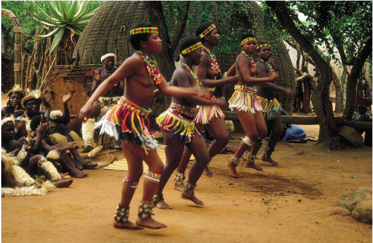
The only way is UP! Yeah! Ba-by!