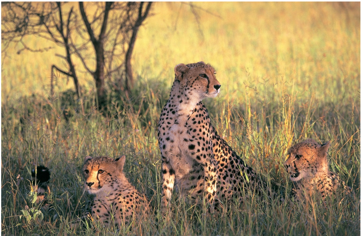
What's going on?