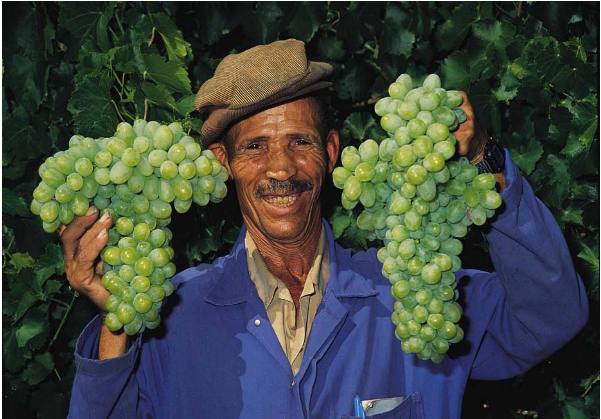
Welcome to South Africa!