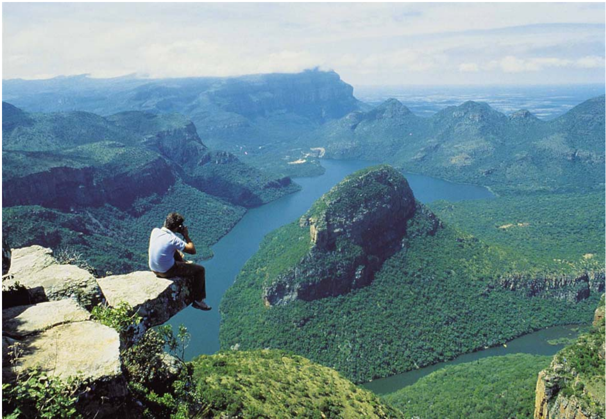
The Blyde River Canyon