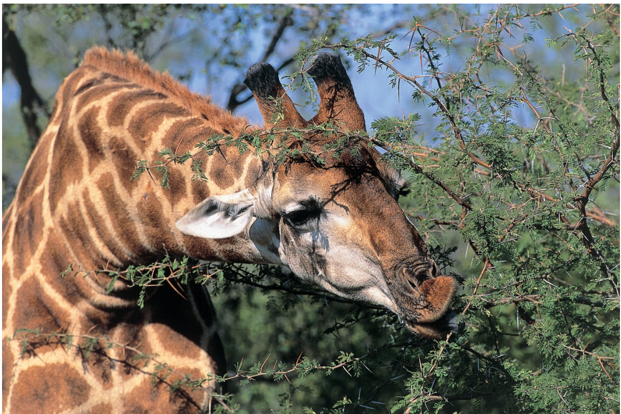
A leather-lipped giraffe enjoys a thorny encounter