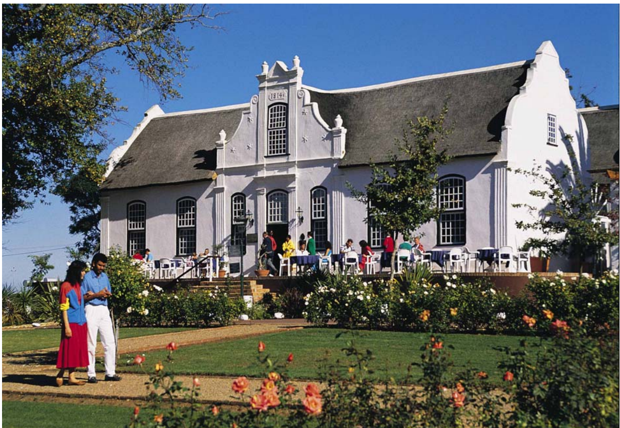
Traditional Cape Dutch Architecture