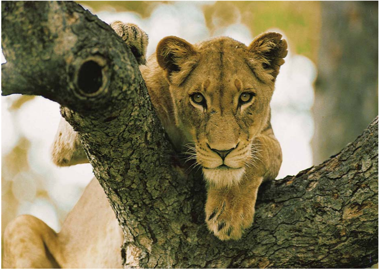
I can't see anyone yet!