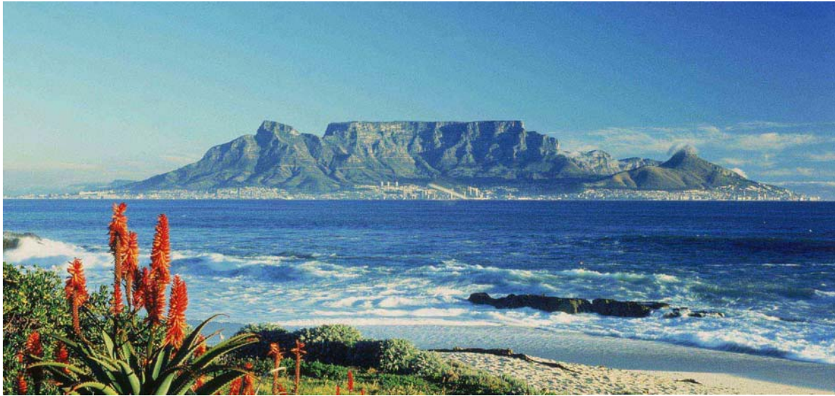
Table Mountain & The Cape Peninsula